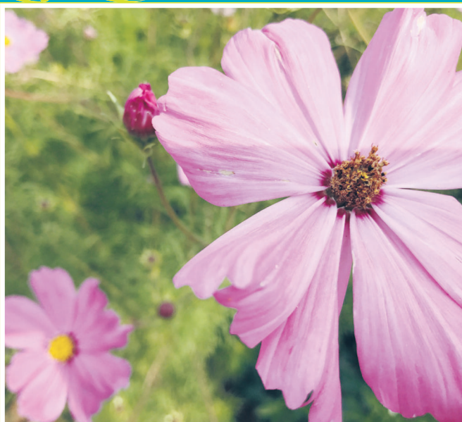
Gwen Maus | Village of Briar Meadow

753-1119, ext. 5369 michael.salerno@thevillagesmedia.com